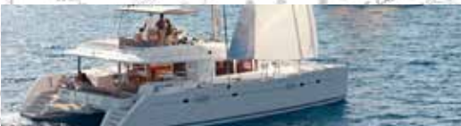
2015 Lagoon 560 (5c/5h) AZULIA II**

Rates range from $21,000- $27,00. Please visit www.sailazuliz.com for specific details on this yacht.