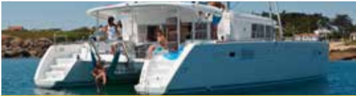
2016 Lagoon 450 (3c/3h) SHANNON

SEASON A DEC. 20. JAN. 9 FEB. 12. APRIL 4